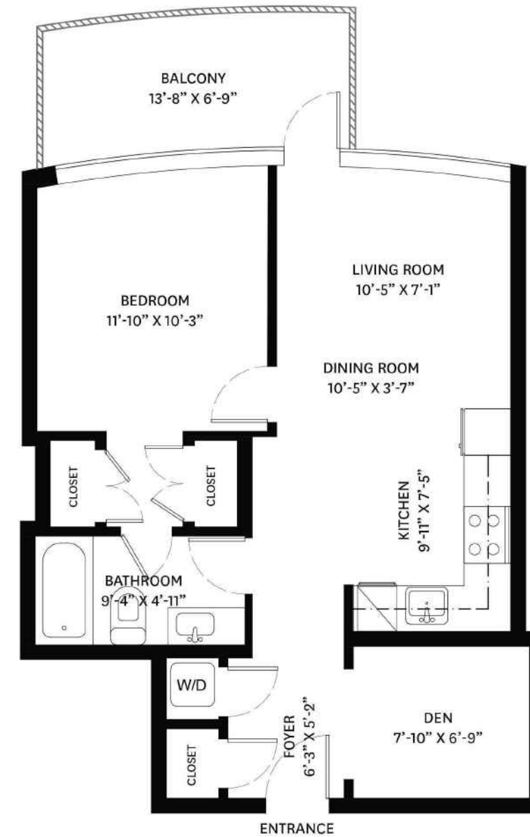
MAIN FLOOR PLAN Ceiling Height: 9'-3"

MAIN FLOOR TOTAL: 615 SQ.FT. BALCONY: 82 SQ.FT.