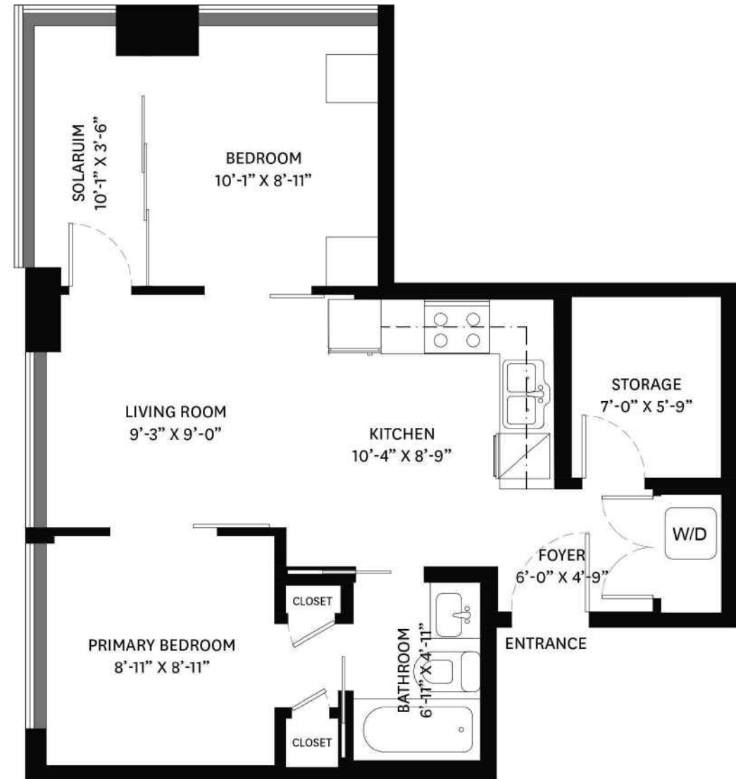
MAIN FLOOR PLAN Ceiling Height 8'-5"